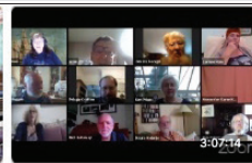
Online Chanteysing Live from the Mermaid's Tavern