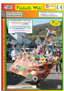
Folklife West May to September