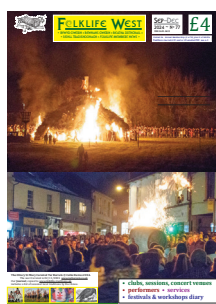
Folklife West September to Dec.