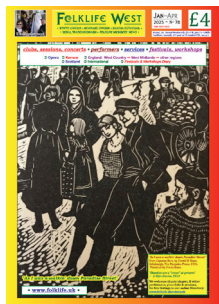
Folklife West January to April

Card: https://ko-fi.com/folklife/shop Cheque: 'Folklife' to 16 Barrett Rise, Malvern, WR14 2UJ.